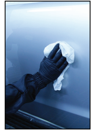
Step 1: Degrease the surface before use