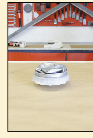
Store 2: Store upside down to prevent the filter from drying out which enables it to be re-used