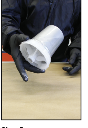
Step 5: No leakage thanks to screw-fit lid and no valve