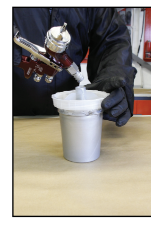
Step 6: Twist on correct adaptor and gun