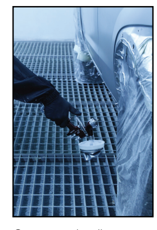
Can spray in all directions, including inverted