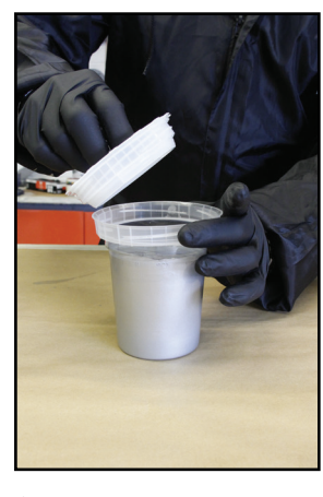
Step 4: Step 5: Twist on the lid No leakage screw-fit lie