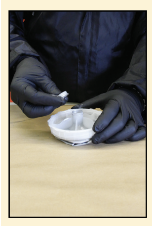
Store 1: If the paint isn't finished, apply a Stopper to keep the paint fresh