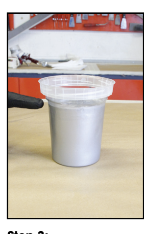
Step 3: IMPORTANT! Do not overfill the Flexible Paint Cup ensures correct collapse of cup in use